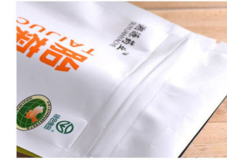
Film packaging bag